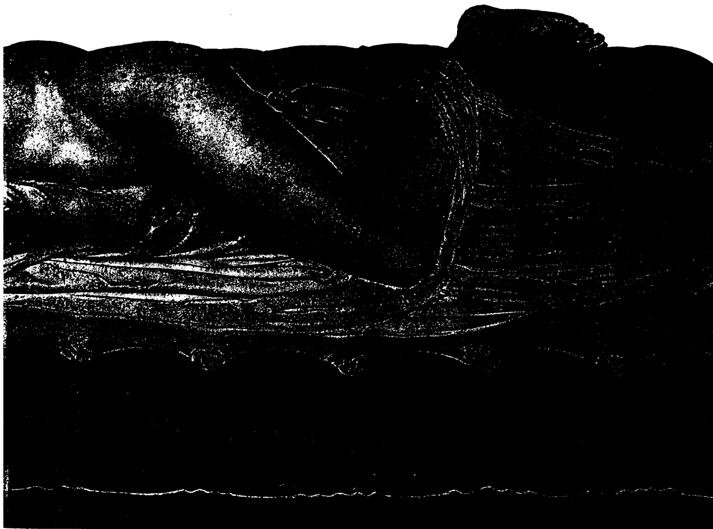
Sleeping Hermaphrodite, Roman, Second Century B.C.

In reality though, few such students would make it as